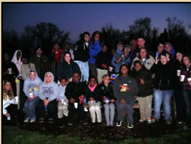
Students from USI's Service Learning Office and Phi Delta fraternity partnered with energetic young volunteers from the Dream Center, Carver Center and the YMCA to provide some much needed litter control and trail maintenance at Howell Wetlands in November.